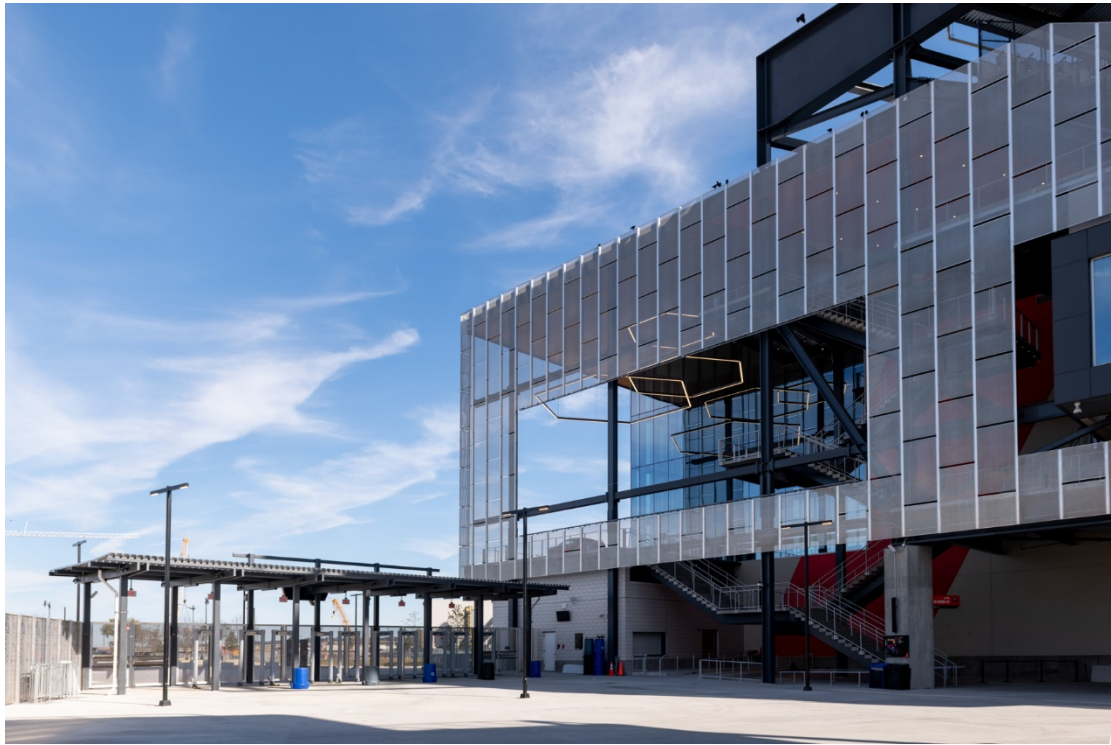
The wide concourse has centrally located restrooms.