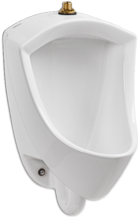
Pintbrook® 6002 series urinal

Vitreous Sanitary Ceramic Ware Flushometer Urinal